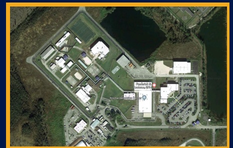
Contract No.: IDC GS-04P-97-LCD-005 Security Improvements & Site Lighting, $1,736,312 Krome Detention Center, Miami, FL