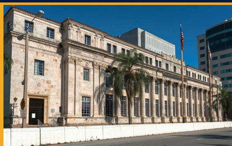
Contract No.: IDC GS-04P-97-LCD-005 1st Floor Demolition & AHU Replacement, $1,195,174 David W. Dyer Federal Courthouse, Miami, FL